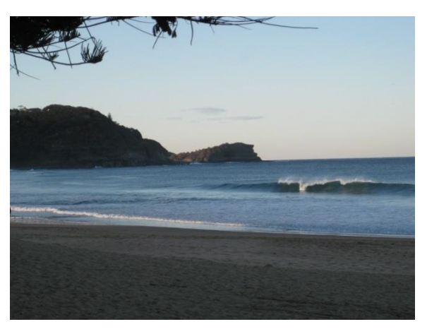
Image 8 – Avoca Beach, Central Coast, NSW with the Skillion, Terrigal in the background. July 2015.

Perhaps the first observation you might make about this artwork (refer to Image 9) is that it is a huge boat without a sea. The sea that should be there is only one that can be constructed by your imagination.