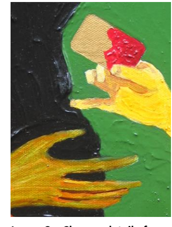
Image 3 – Closeup detail of hand and credit card from Image 2 above.

I could refer to many other features — but I invite you to read the abovementioned passage from Mark, look at the painting, focus on mercy, and come up with your own interpretations. I sometimes ask viewers of this painting (of all ages) to propose speech bubbles for each aspect of a particular painting (in this case Jesus, the woman, the card, the table, the mountain, etc). What do you think Jesus is saying with respect to mercy? How does the woman respond — what type of cure is she requesting of Jesus?