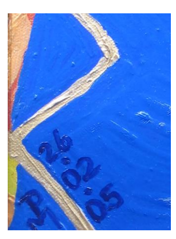
Image 4 – Closeup of hem of Jesus' garment and artist's signature from Image 2 above.

In my view, this painting, as for others discussed throughout this paper, returns us, not only to lost meanings of 'waiting', 'dwelling' and Sabbath, but to one of the fundamental meanings of mercy – and one linked to our own ethical behaviour as well as the attributes of God. Mercy at its most basic level is that benevolence, mildness or tenderness of heart which disposes a person to overlook injuries. It looks for the very best a person can be and treats them better than they would otherwise be treated. Mercy is tempered by justice, it forgives all (seventy times seven). It is a difficult concept to define but is perhaps nearest in meaning to 'grace'. It implies all of but more than benevolence, tenderness, mildness, pity, compassion, justice and clemency.<sup>18</sup>