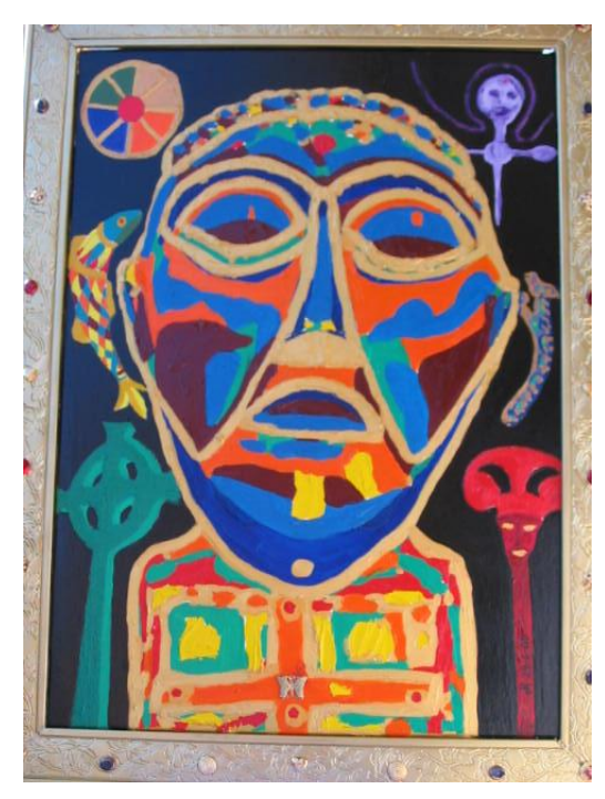
Image 11 - Celtic Christ, 29 May 2006, by Peter Mudge. Permission of the artist.

What I want to show in my work is the idea which hides itself behind so-called reality. I am seeking for the bridge which leads from the visible to the invisible, like the famous cabalist who once said: "If you wish to get hold of the invisible you must penetrate as deeply as possible into the visible". 52