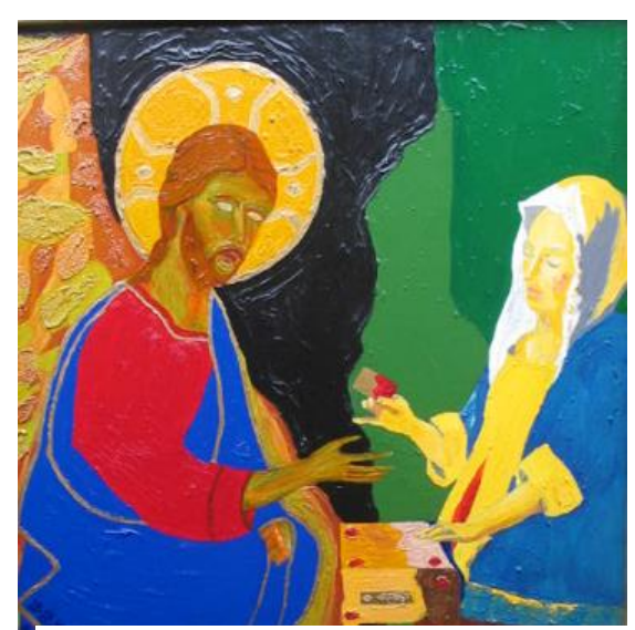
Image 2 – 'Jesus cures the woman with the flow of cash' by Peter Mudge, 2005. Permission to reproduce image from the artist as author.

The woman with the flow of cash (the right hand side figure in Image 2) is vulnerable or wounded. The red colour indicates that she is accustomed to regular bleeding. The root word behind "vulnerability" is the Latin vulnus meaning "wound". To be vulnerable is to leave one's wounds exposed. The wound is the site of both vulnerability and healing.<sup>7</sup>